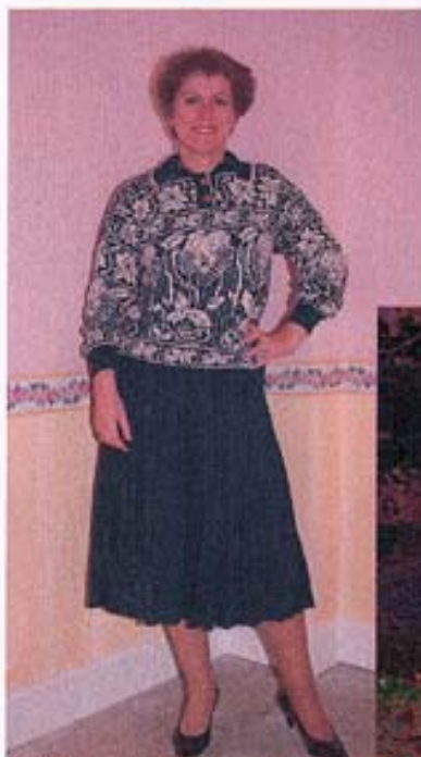
Fairisle Jumper & Sunray Skirt Hobby and Chenille

Full instructions on all patterns Standard gauge unless otherwise stated