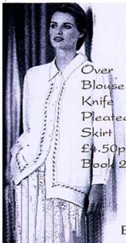
Over Blouse & Knife Pleated Skirt £4.50p Book 28