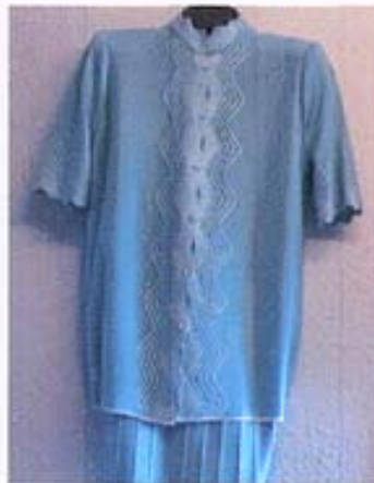
← NEW .....Book 47.....£4.50p Blouse and Skirt with racking and plating Standard gauge with ribber Bramwells Silky