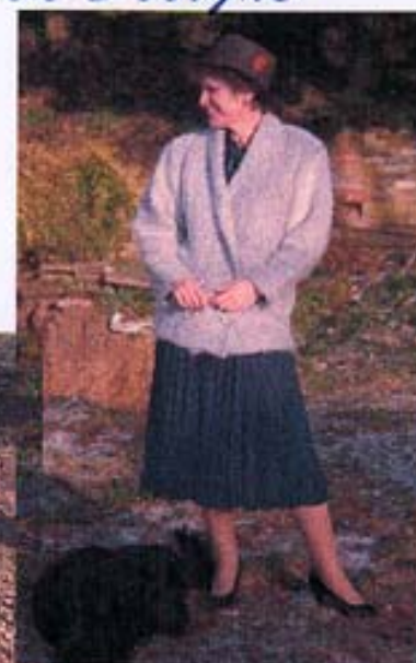
Woven Mohair Jacket Book 38 £3 Bramwells Silky woven with 4ply Mohair