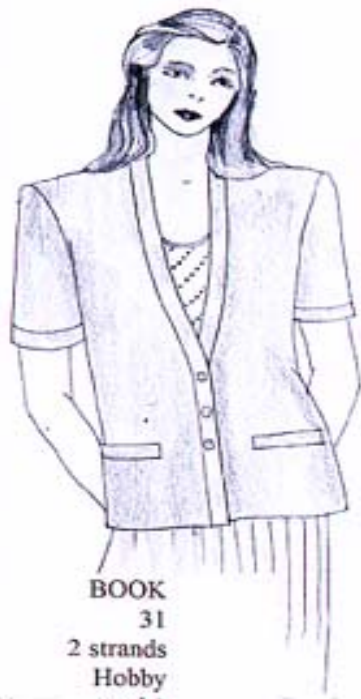
BOOK 31 2 strands Hobby and 1 strand

Book 35 Full ndl rib in 2 strands of Hobby. Rever knitted all in one piece with body. Brother or Passap £3.50p ↓