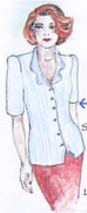
← Book 35 Short Sleeved Reversed Jacket in Hobby Full Needle Rtr Sizes 32 to 48 Bust Long Sleeves included £3.00p