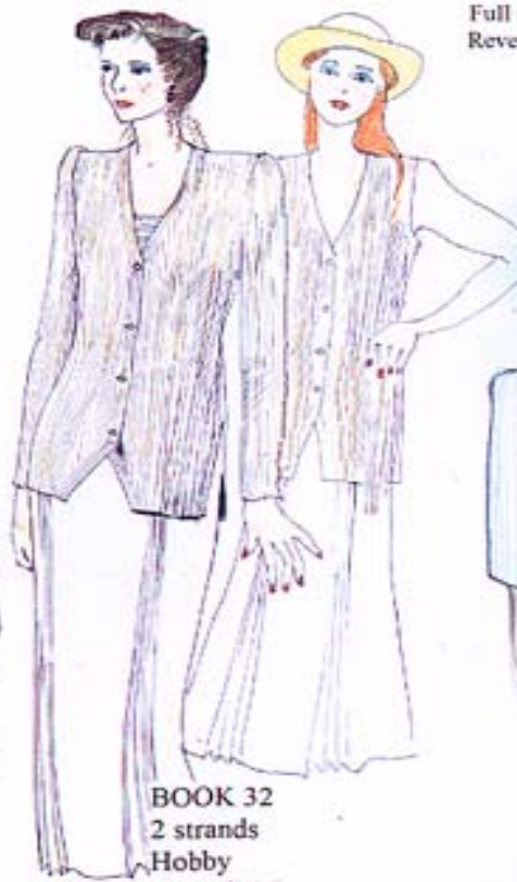
BOOK 32 2 strands Hobby Full ndl Rib Brother £3.50 Sep: Skirt