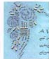
A Wide selection of iron motifs which glitter like diamonds available, just send 2 first class stamps