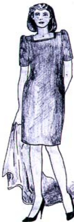
Dress & Jacket Book 30 £4.50p