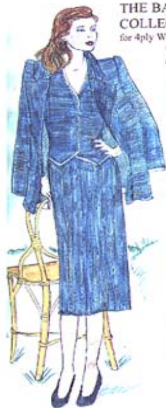
THE BASIC COLLECTION...£7.50p for 4ply Wool. Three suits, waistcoats and skirts all in Forsells' wool