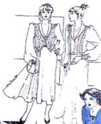
Three Piece Suit Knitted in Hobby And Silky Decorated With Woven Chenille, Viscose Ribbon And A Fancy Chenille. Standard Gauge Machines With A Weaving Facility.