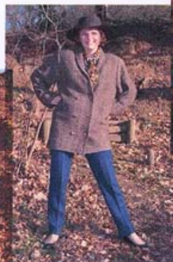
Woven Wool Jacket Book 40 £3