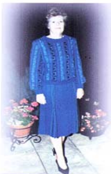
Two piece suit in 2 strands of mossy featuring weaving with ribbon on the top. Book 18 £4.00p