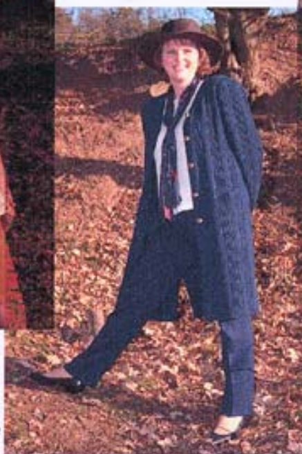
Longline Jacket & Trousers Book 44 £5 Longline Jacket & Skirt Book 43 £4 Passap Longline Jacket & Skirt Book 45 £5