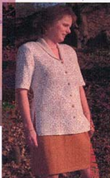
Jacquard Jacket Book 36 £3.50p Bramwells' Hobby Standard gauge or Passap Please state which machine