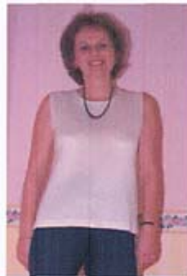
Book 45 Slip Styled Top in Bramwells' Silky Sizes 32 to 48 Bust NOW with long Sleeves £3.00p