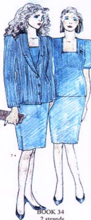
BOOK 34 2 strands Janeiro woven with Castoro from Yeomans