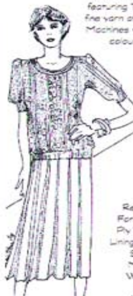
Two Piece Suit knitted in Sable Crepe featuring Two Colour Tuck Stitch with a fine yarn of your choice. Standard Gauge Machines with a Ribber and a Single bed colour changer would be useful