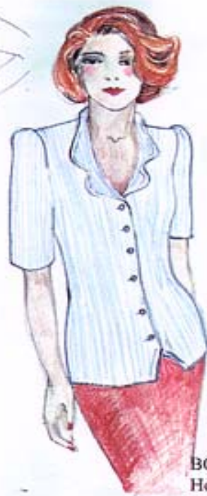
BOOK 33 Hobby an Silky Single Bed Brother £4