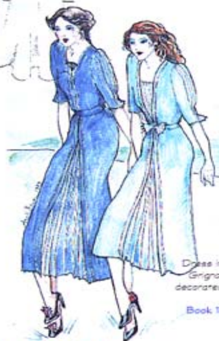
Dress in Yeomans Grigio and silky decorated with ribbon