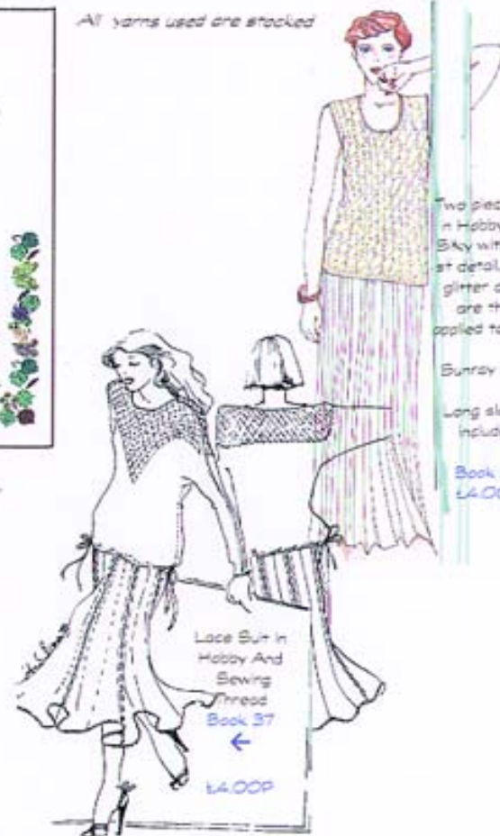
Two piece suit in Hobby and Silky with Slip st detail. Iron glitter disks are then applied to top. Sunray skirt Long sleeve included Book 27 £4.00p