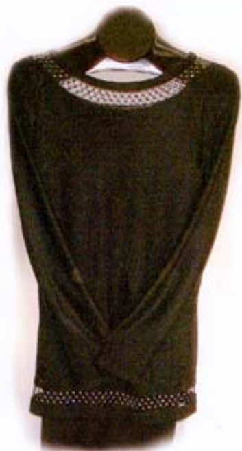
Classic Long Sleeved Evening Top in 2 strands of Fine / French Crepe Knitted on a Standard Gauge Machine with Austrian Crystal Rhinestone Trims £3 No Ribber Required. Size 34 to 46 Bust