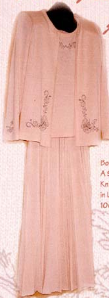
Book 65 A Summer Twinset & Skirt Knitted on the Standard Gauge in Uppingsams Filagres (2 strands) 100% Acrylic