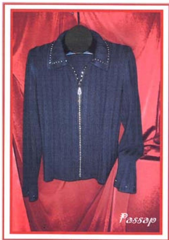
Book 72 Knitted in 4ply Sable Crepe All Passap Machines Sizes 30 to 46 Bust £3